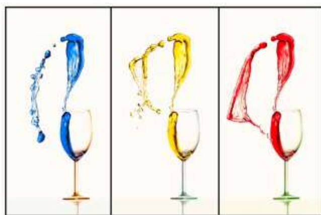
Photograph by Alan C