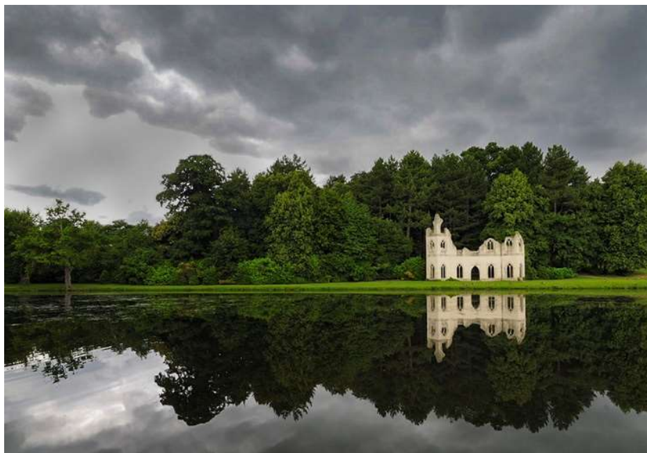
Photographs by Alan