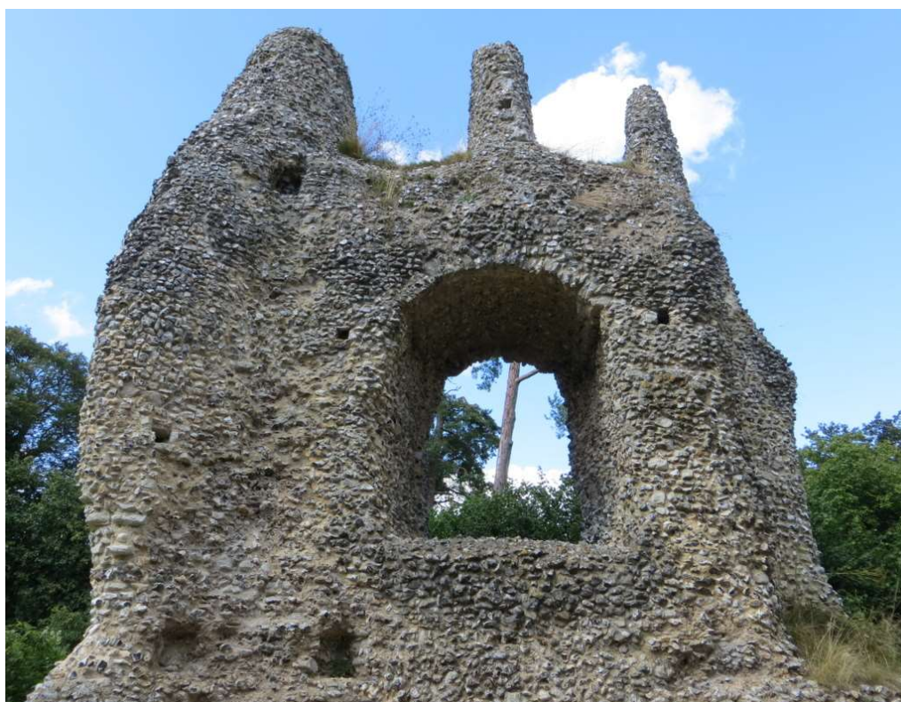
Photographs by Peter