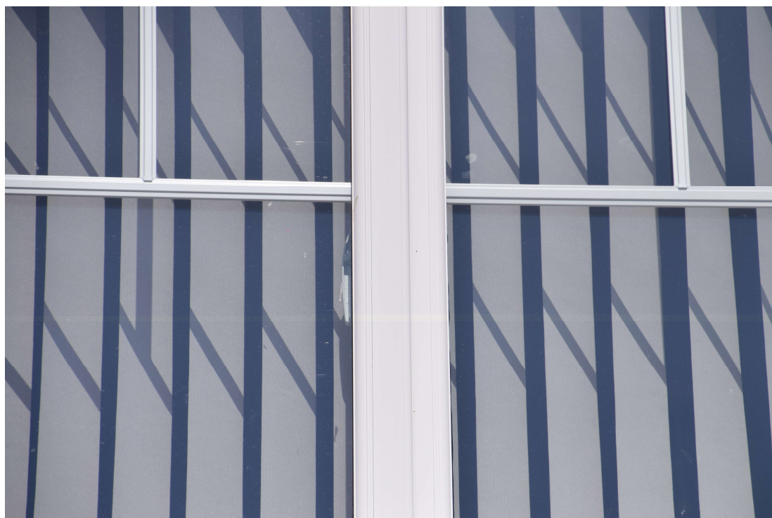
Photographs by Jackie